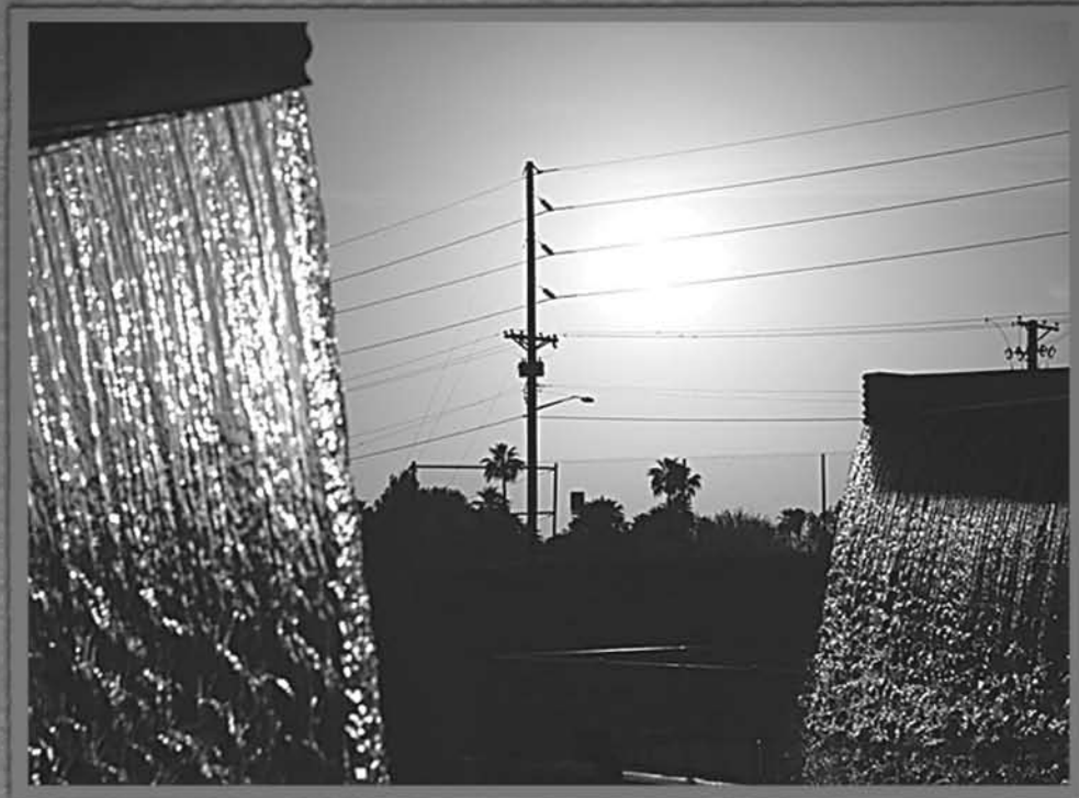
SRP's historic Arizona Falls